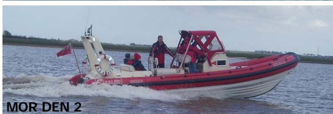
MOR DEN 2