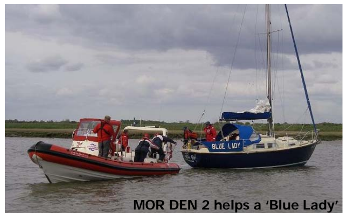
MOR DEN 2 helps a 'Blue Lady'